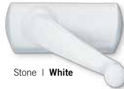
Stone | White